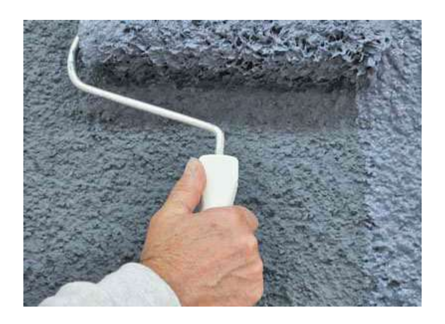
Interior and Exterior painting

Sydney Quality Painters carry out extensive interior and exterior painting work for both domestic and commercial customers'. And it is not just painting but we also take care of decorative finishes, textured painting, textured effects, and any type of coating work too. So for your home, office or any building, if you want painting work or some specific painting services, we are good for that.